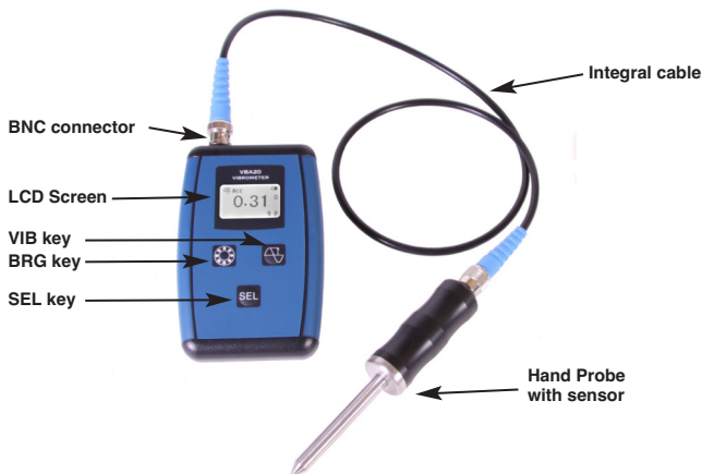
Figure 1. The VBA20